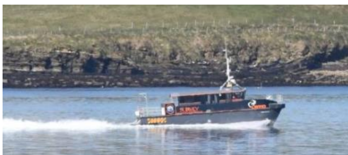
Figure 3 – ROV support Athena

The works shall be co-ordinated by the Teal of Wick who will be maintaining a listening watch on Channel 16.