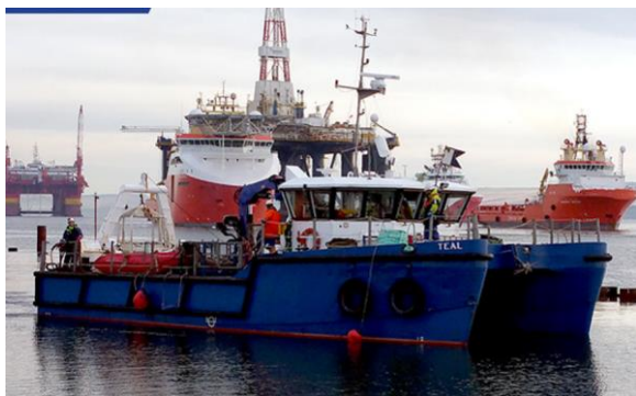
Figure 1 – DSV Teal of Wick

The vessel the Causeway Explorer shall be onsite acting as guard and safety vessel for the works and the Athenia will be providing ROV support