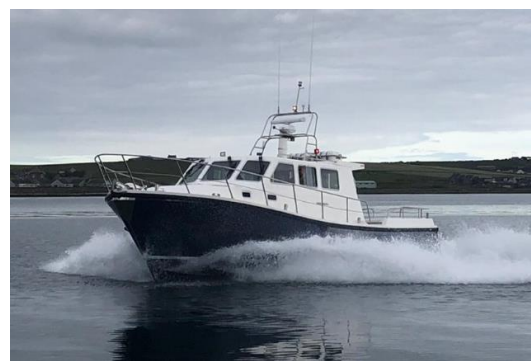
Figure 2 – Guard / Safety Vessel Causeway Explorer